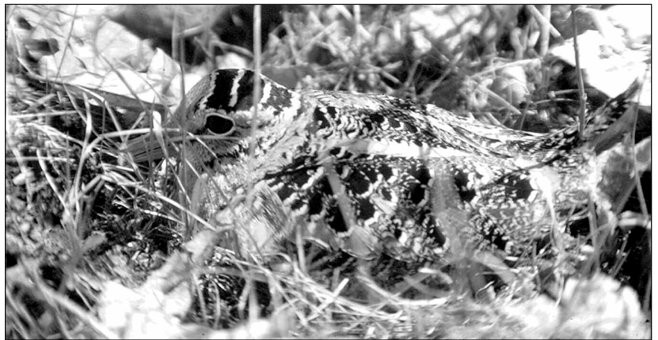
American Woodcock, B. Morin

What is the rule of thumb when trying to spot elusive birds? Well, there really isn't one, except perhaps patience, double check where you have looked and more patience. The bird that you have been trying to find, may actually be a lot closer than you think!